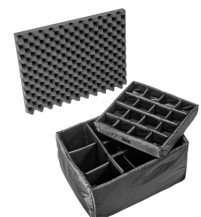
1625 Padded Divider Set