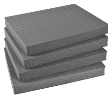
1622 Pick N Pluck™ Sections Only (set of 4)