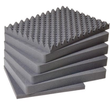
1621 6 pc. Replacement Foam Set